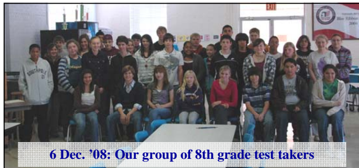
6 Dec. '08: Our group of 8th grade test takers

► Student committee: Remember all accepted students will be invited to participate in a student committee which will begin meeting monthly in late February.